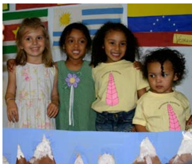
International Night Camaraderie