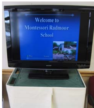
TV with PowerPoint.