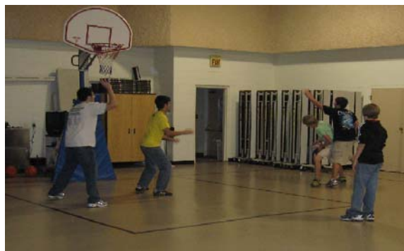
Alumni playing basketball.