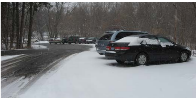
Twenty new parking spaces.