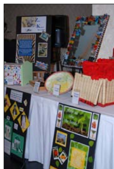
Classroom Projects for the Live Auction