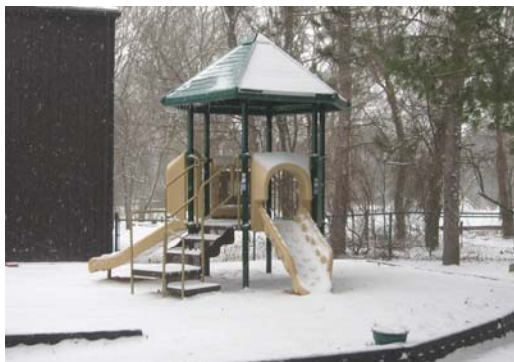
Toddler Outdoor Playground Equipment