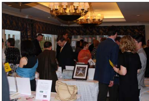
Bidding in the Silent Auction